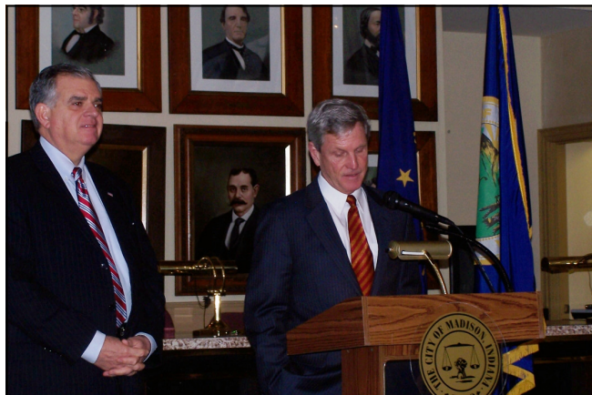
U.S. Transportation Secretary Ray LaHood (left) and Congressman Baron Hill recently in Madison announcing the TIGER Grant award.

Madison welcomed U.S. Secretary of Transportation Ray LaHood on February 22 to town for a ride across the bridge and a press conference. At the press conference, it was apparent that Indiana and Kentucky state officials were speaking from the same play book. The superstructure replacement would move forward and construction would begin in 2010 and be complete i012. The result would be a safe and reliable river crossing! Inconvenient but safe bridge approaches could be addressed separately as the necessary right of way acquisition